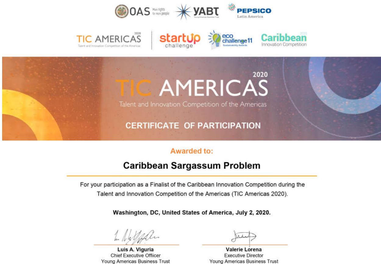
Figure 1- Recognition of achievement by the TIC AMERICAS

https://ticamericas.net/finals/finalist/caribbeansargassumproblem.php